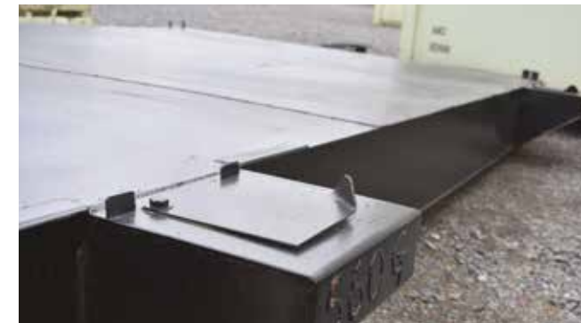
Effluent Tanks & Effluent Tank emptying