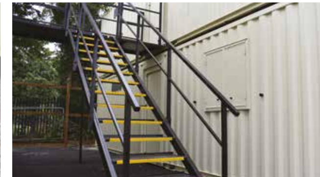
Staircases, Steps and Ramps