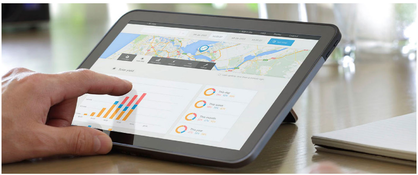
Full online monitoring via the Victron VRM website.

Keeping noise levels on construction sites to a minimum at night is a requirement in most residential and built up areas. However, during these hours there is still a requirement for power lighting, security, dry roomings etc. SiteGrid helps balance this issue by supplying low loads at night via the battery bank, meaning the generator never needs to run. Great for both noise levels and emissions.